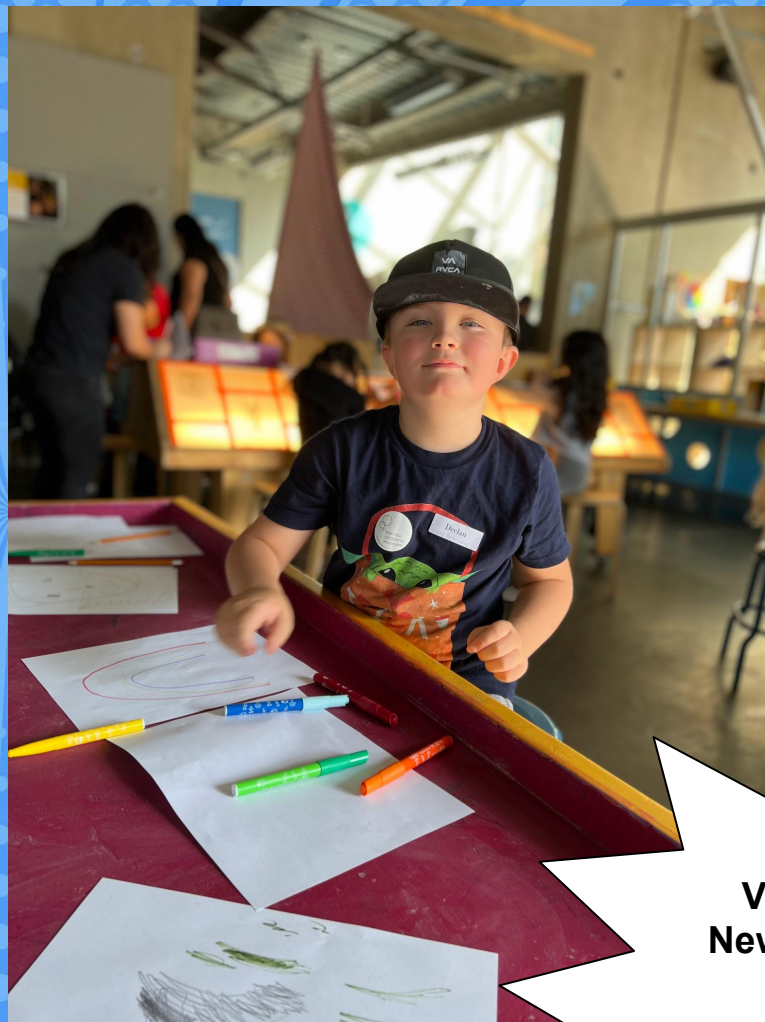
Visiting the New Children's Museum